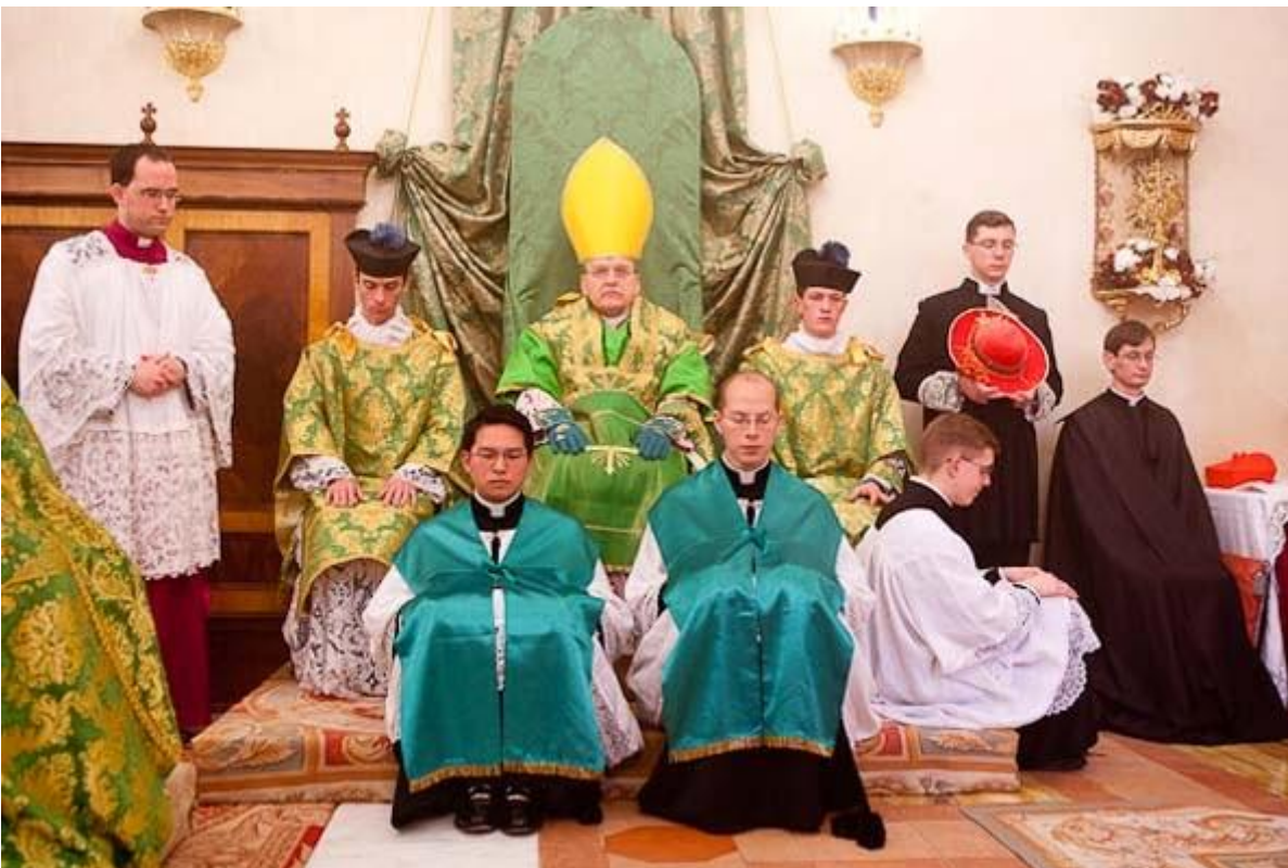
Cardinal Burke, author of this week's open letter.